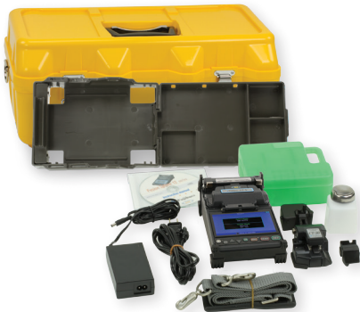
Fujikura 22S Kit 1