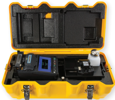
Workstation in Transit Case