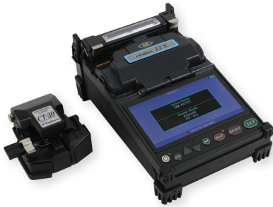
22S (with Cleaver for scale)