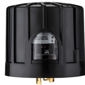
DCC: DTL CONNECT CONTROL

Remote controlled locking type photocontrol