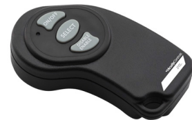
DCR: DTL CONNECT REMOTE