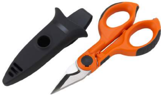
Safety Holster with belt clip