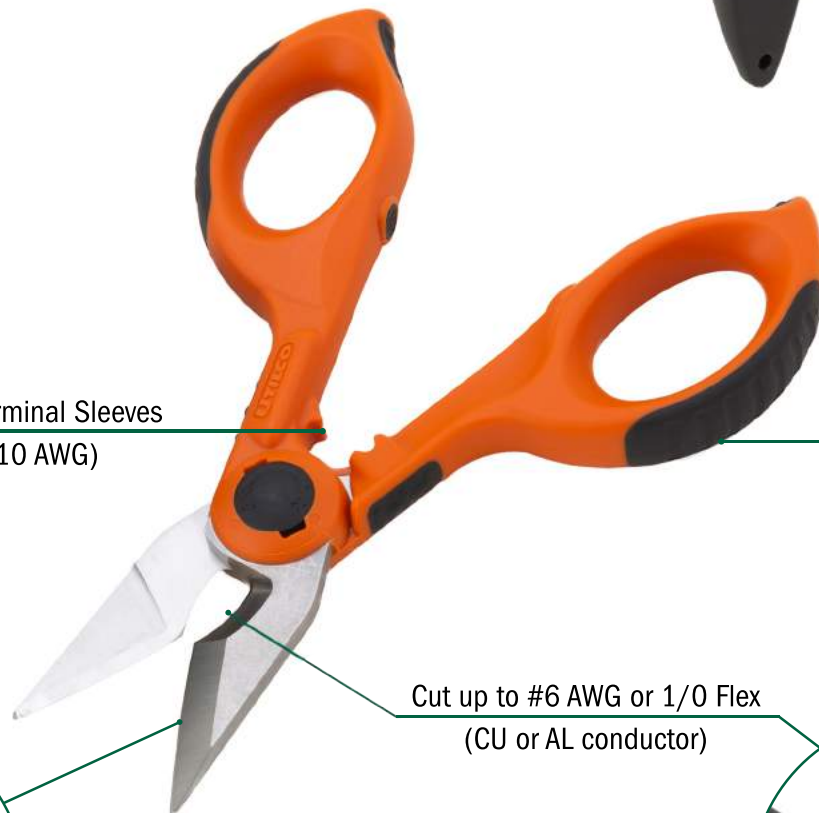
Cushion Grip Handles for extra leverage