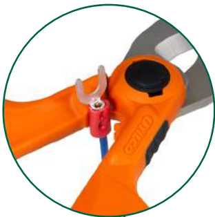
Crimp Terminal Sleeves (#22 - #10 AWG)